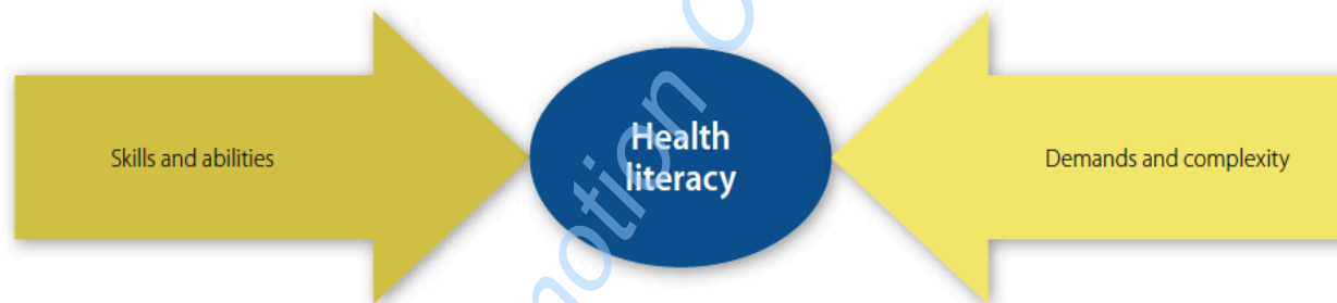
Fig. 1. Interactive health literacy framework

Source: Parker R. Measuring health literacy: what? So what? Now what? In Hernandez L, ed. Measures of health literacy: workshop summary, Roundtable on Health Literacy . Washington, DC, National Academies Press, 2009:91–98.